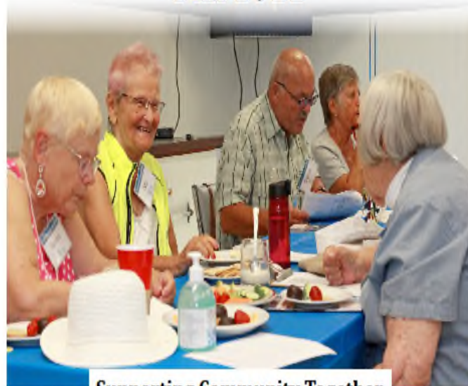
Supporting Community Together